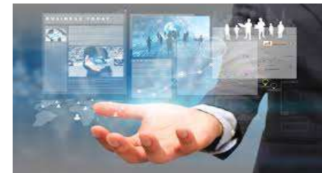
Market insights , 2015